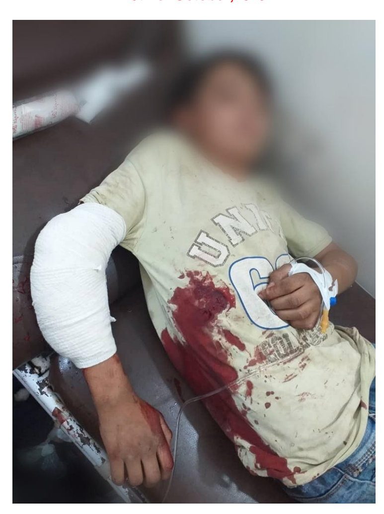
20th of October,2019

On October 9, 2019 the Turkish army with Islamic allies started an offensive targeting mainly the area between Sere Kaniye and Tell Abiad. SDF in turn started to defend it. After few hours a massive displacement of population started toward south areas of Hasake, Raqqa, Ein issa and Tel Tamir. Below the detailed report day by day with photos and the casualties recorded.